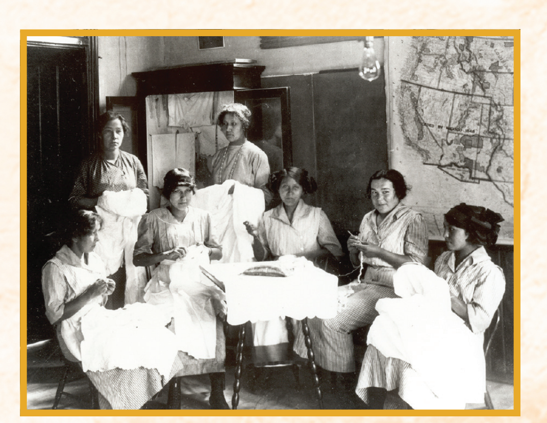
Girls in Sewing Classroom